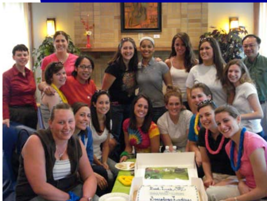
Sociology Club enjoying time outside of the classroom!