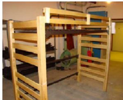
EXAMPLE OF ASSEMBLED LOFT BED