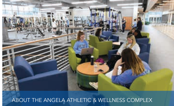
ABOUT THE ANGELA ATHLETIC & WELLNESS COMPLEX

Saint Mary's College reserves the right to change or cancel any summer camp session for any reason, including if minimum registration enrollments are not met.