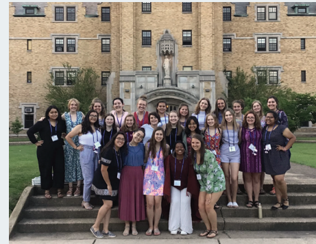
One of the two Embody cohorts from summer 2019.

Over the course of four years, 23 women who participated in Embody have enrolled as Saint Mary's students, including five this fall. The Embody program has been supported by a grant from the Lily Endowment, Inc., and Saint Mary's is looking for donors to help the program continue.