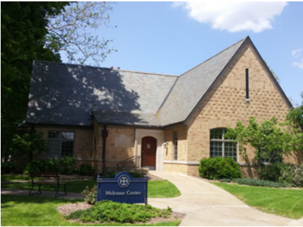
Office of Graduate Studies