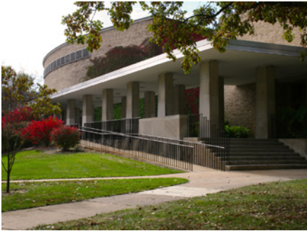
Moreau Center for the Arts