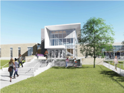
Angela Athletic & Wellness Complex