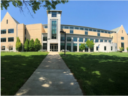
Spes Unica Hall