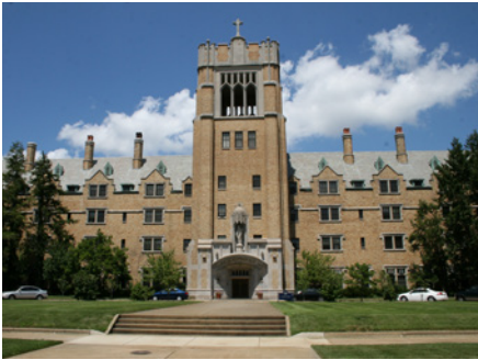
Le Mans Hall