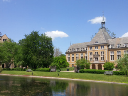
Haggar College Center