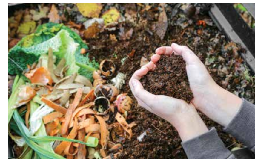
Student leaders direct the Campus Dining compost initiative that makes use of food waste as soil enrichment at the College’s Sustainable Farm.

To learn more about how Saint Mary’s and the Sisters of the Holy Cross are addressing the climate crisis, and Laudato Si’, visit cscsisters.org/ourtimeisnow .