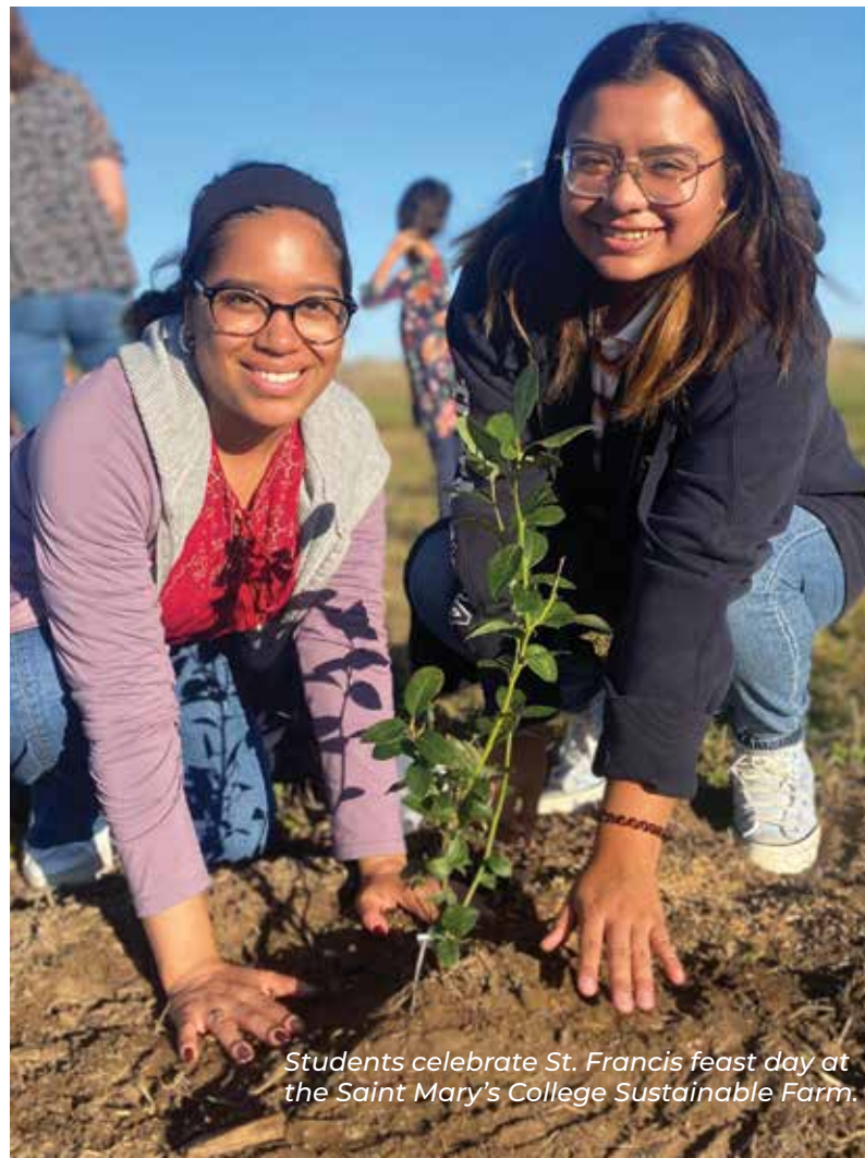
Students celebrate St. Francis feast day at the Saint Mary's College Sustainable Farm.

Class Gift to the Saint Mary's Fund! We were acknowledged at the banquet and received a round of applause. Our participation percentage was outstanding.