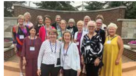
Class of '70 alumnae at the Friday evening Reunion dinner.

The other amazing fact about our classmates is that we are all so attuned to the politics and the history of the day, and although we may have differing points of view, it was clear that we are all just as involved now as we were in the '60s and '70s in ensuring our rights are protected, women's leadership continues to advance, and war is averted.