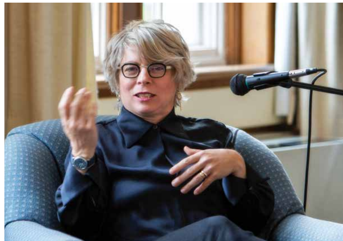
Lepore is the David Woods Kemper Professor of American History and Affiliate Professor of Law at Harvard University, as well as a staff writer at The New Yorker. Other essays and reviews have appeared in the New York Times, Times Literary Supplement, Foreign Affairs, Yale Law Journal, American Scholar, and American Quarterly.