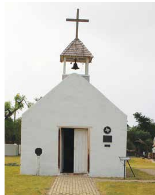
Students spent an emotional day learning about La Lomita Chapel in Mission, Texas. A historical landmark, La Lomita was built in 1865 and served as a church for local ranchers as well as a place of rest for generations of travelling missionaries, like the Cavalry of Christ.