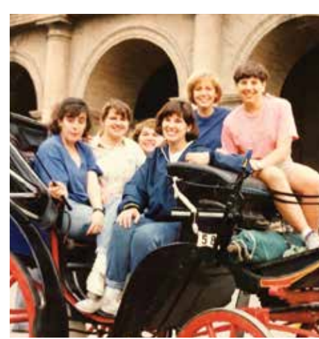
Studying abroad in Rome!