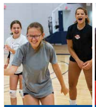
Athletic Camps For All Ages and Skill Levels

Explore new and expanded offerings for students ages 6-22, including opportunities to earn college credit and music programs open to all. Scholarships available. Learn more and register today at saintmarys.edu/SMC_camps