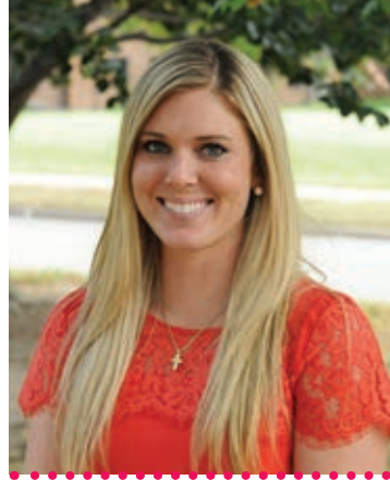
Alma Mater Bethel College