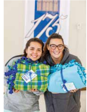
During the celebration, students made blankets and other items for local people in need.

The College will also host Discover Saint Mary's: A Walk in Time. This on-campus event will allow visitors to develop a deeper understanding and appreciation of the faith and heritage of the College — past, present, and future. For more information, visit www.saintmarys.edu/175 .