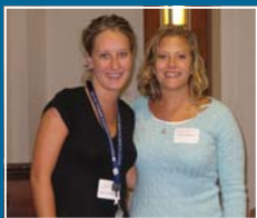
Seniors enjoy the Annual Spring Luncheon p. 3