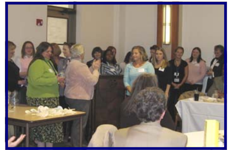
The Class of 2007 with field instructors

After the induction, seniors were recognized. They then introduced their field instructors and presented them with a gift. Afterwards, seniors presented their portfolios to the luncheon attendees. Everyone was very impressed with the amount of time and effort that went into their excellent portfolios.