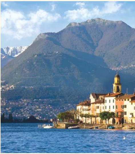
A funicular ride to the top of Switzerland's Monte Brè offers magnificent views of the resort towns of Lake Lugano.

small family-owned shops to the Piazza Cavour and the tranquil lakeside promenade. The Piazza del Duomo, considered to be the most beautiful cathedral in Lombardy, took nearly 400 years to complete and reflects a seamless blend of Gothic and Renaissance styles.