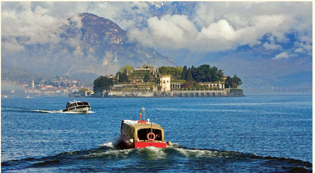
Isola Bella is the most spectacular of the three Borromean Islands, located on the Italian side of Lake Maggiore. Visit the magnificent 16th-century villa and stroll through one of the most beautiful gardens in the world.

Founded by the Romans in 196 B.C., Como’s cobblestoned passages wind past medieval towers and walls, Renaissance palaces and churches, Neoclassical 19 th -century villas and