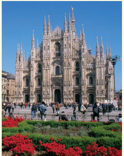
Visit Milan’s towering Duomo on the Pre-Program option, home to some of Italy’s finest religious art.

Cruise among Lake Maggiore’s Isola Bella, Isola di San Giovanni, Isola Madre and Isola dei Pescatori, collectively known as the Borromean Islands, named after the powerful and influential Borromeo family.