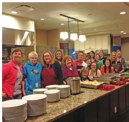
Through the Meals from the Heart program, Chicago East alumnae had the opportunity to help out at the Ronald McDonald House near Lurie Children's Hospital in March.

The Chicago East Club had quite an active spring and summer! 2014 has been our busiest year with lots of events and service opportunities. The Club even created a very popular t-shirt to help raise scholarship funds. The shirt was a nod to the city of Chicago and Saint Mary's.