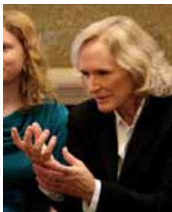
Students received acting advice from Glenn Close.

On March 15, stage, screen, and television actor Glenn Close graced O'Laughlin Auditorium and thrilled a full house of enthusiastic students, faculty, and local press with her stories about her childhood and award-winning acting career.