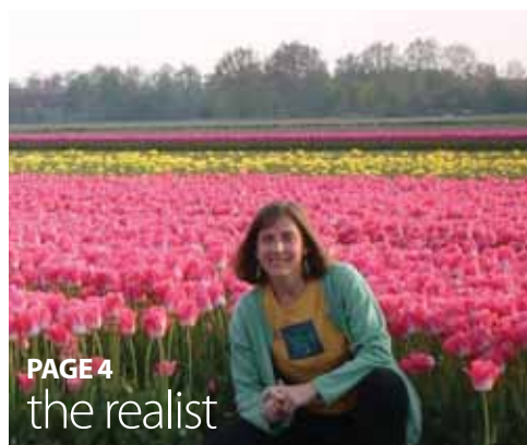
PAGE 4 the realist