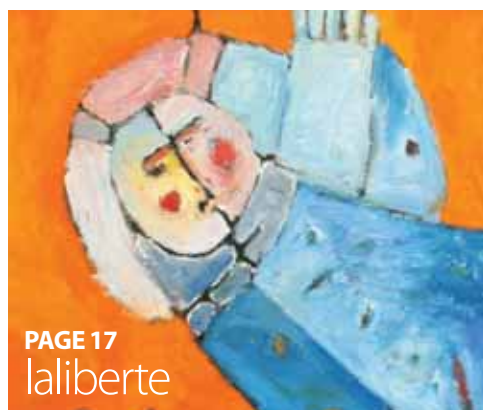
PAGE 17 laliberte