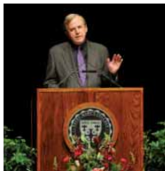
Thomas Cahill at the podium

On September 22, Thomas Cahill, bestselling author of How the Irish Saved Civilization , gave the 2010 Christian Culture Lecture. His talk, “The End of Christian Divisions: Achieving Reunion Through Truth-telling,” took the audience through the millennia of the divisions among Christians—Catholic, Protestant, and Orthodox.