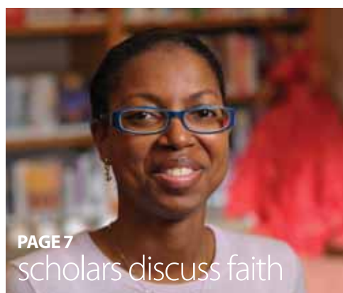
PAGE 7 scholars discuss faith