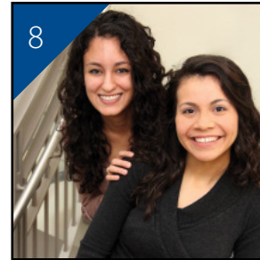
The World Needs More Saint Mary's Women Meet the students and professors impacted by our campaign.