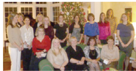
Members of the Columbus club gathered for a Founders' Day celebration in December. Alumnae enjoyed a silent auction and wine tasting, all while raising money for the Columbus Club Scholarship.